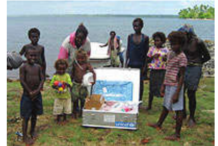
Tsunami-affected children in the western Solomon Islands gather around a recreation kit provided by UNICEF to help restore a sense of normalcy in their lives.

Storage of the footballs and volleyballs in hot temperatures for long periods of time may affect the quality of the ball material. Children should have access to safe water supplies during the recreation activities