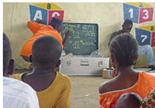
LIBERIA: Children learn maths using the contents of a school-in-a-box. The kit is a ready-made educational solution, packed in an aluminium box that can be used as a blackboard.

The School-in-a-Box guidelines (with pictures) are available in English, French, Spanish, Arabic, and Portuguese.